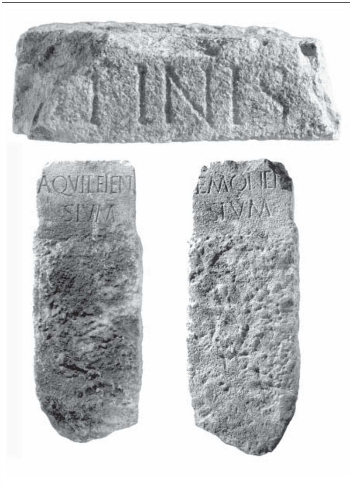
Fig. 2: The inscriptions on the boundary stone from Bevke. Sl. 2: Napisi na mejniku iz Bevke.