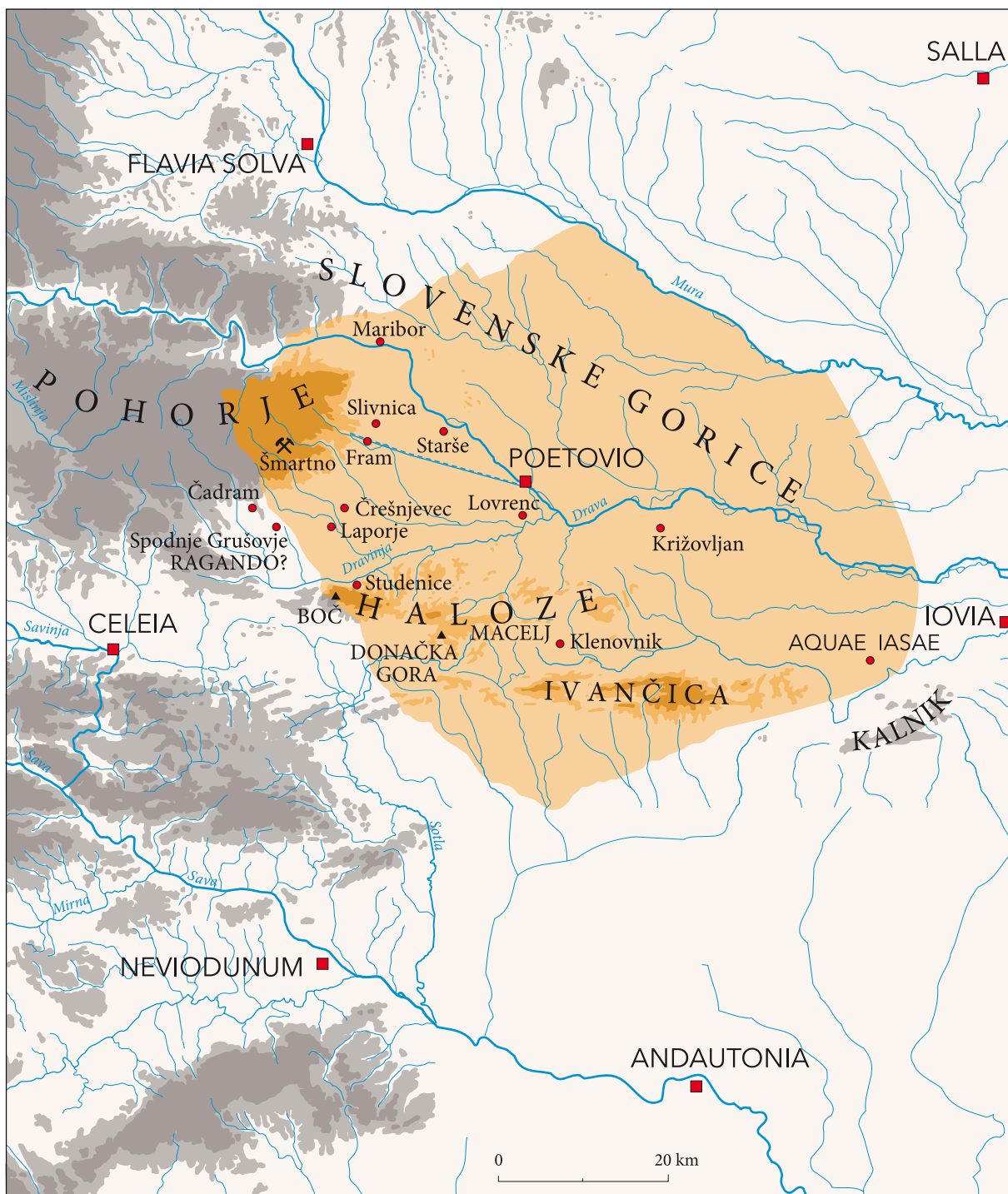
Fig. 4: Theoretical boundaries of the territory of Poetovio.

Sl. 4: Teoretična meja upravnega območja Petovione.