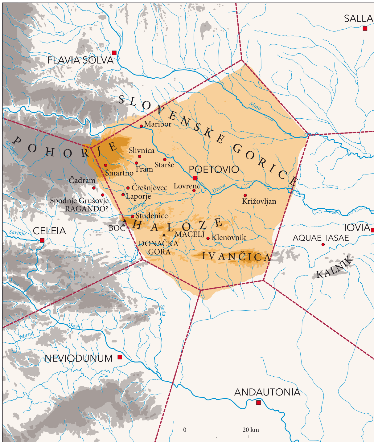
Fig. 3: Thiessen polygons and site catchment analysis.

Sl. 3: Thiessnovi poligoni z upoštevanjem izračuna porabe energije za pot.