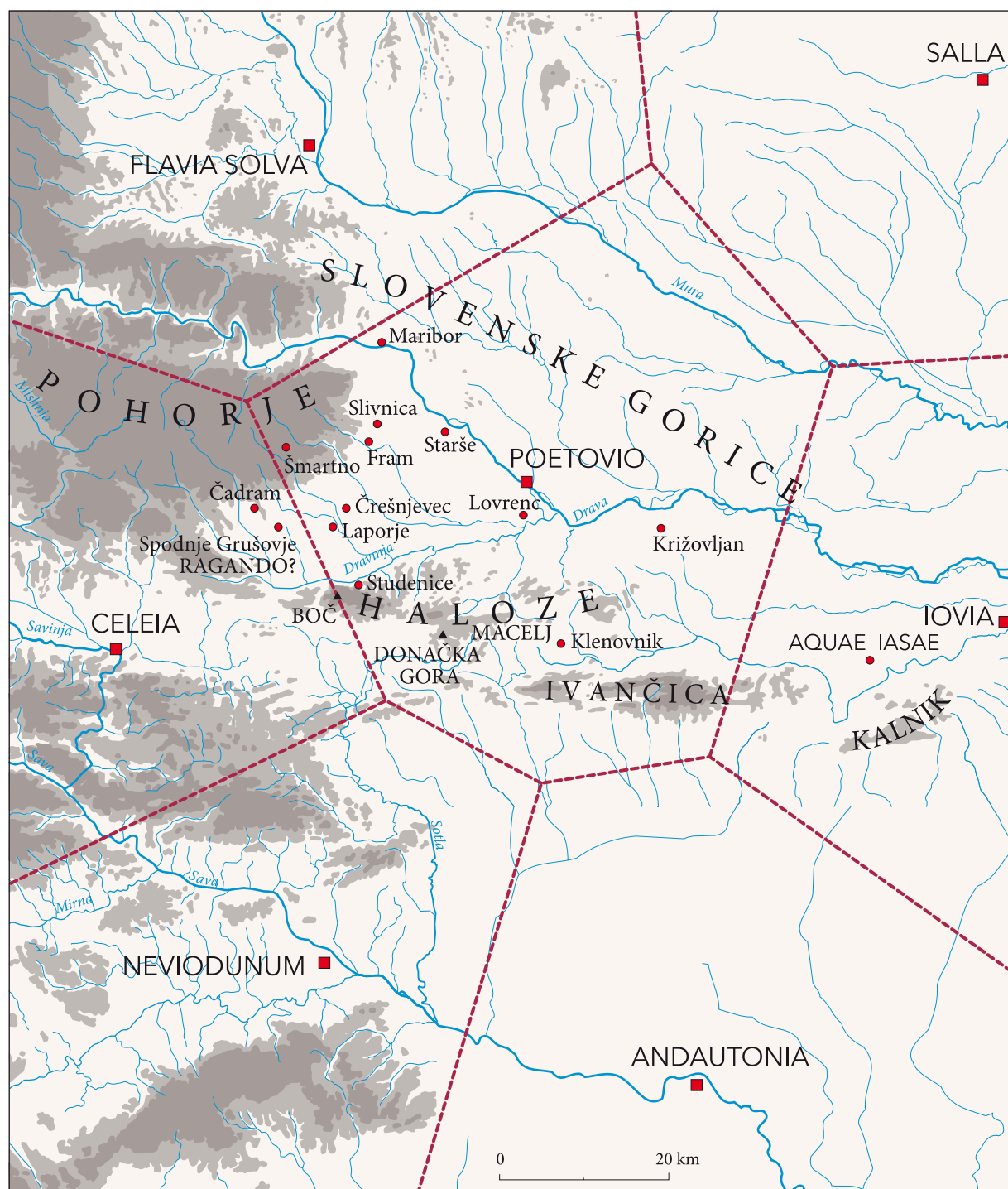
Fig. 2: Thiessen polygons. Sl. 2: Thiessnovi poligoni.

the assumption that the administrative boundaries were the same as the ideal economic ones. Very important in drawing Thiessen polygons is to map sites of the same type, because the underly-